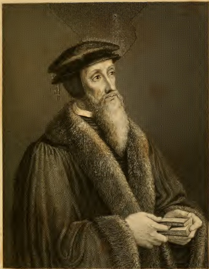
Engraved by W. Bell